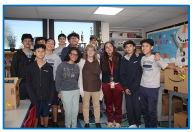
Students from St. Louis the King School