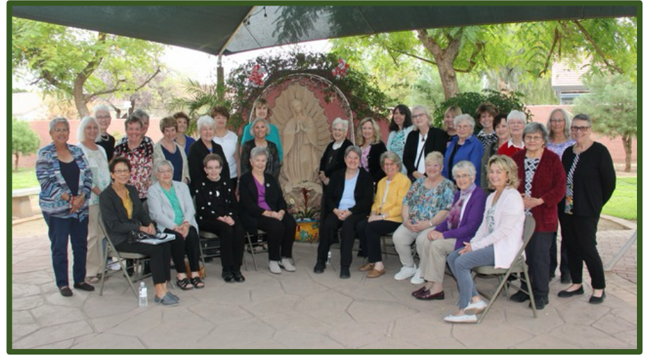
The Christ Child Society of Phoenix enjoyed a wonderful Day of Prayer 2024 at Our Lady of Guadalupe Monastery in Phoenix.

*A PDF of Mary's Way of the Cross was included in the email with this newsletter.